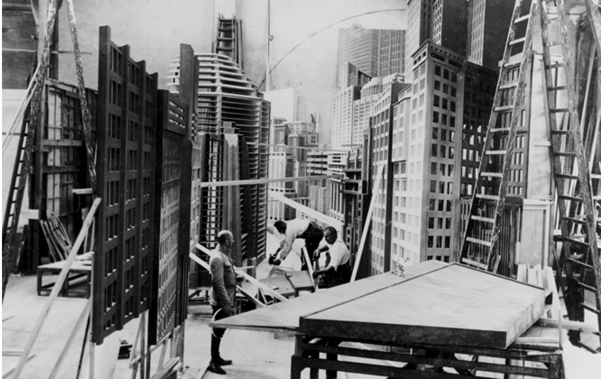
Construction of a model of the city